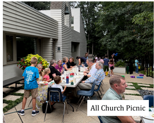
All Church Picnic