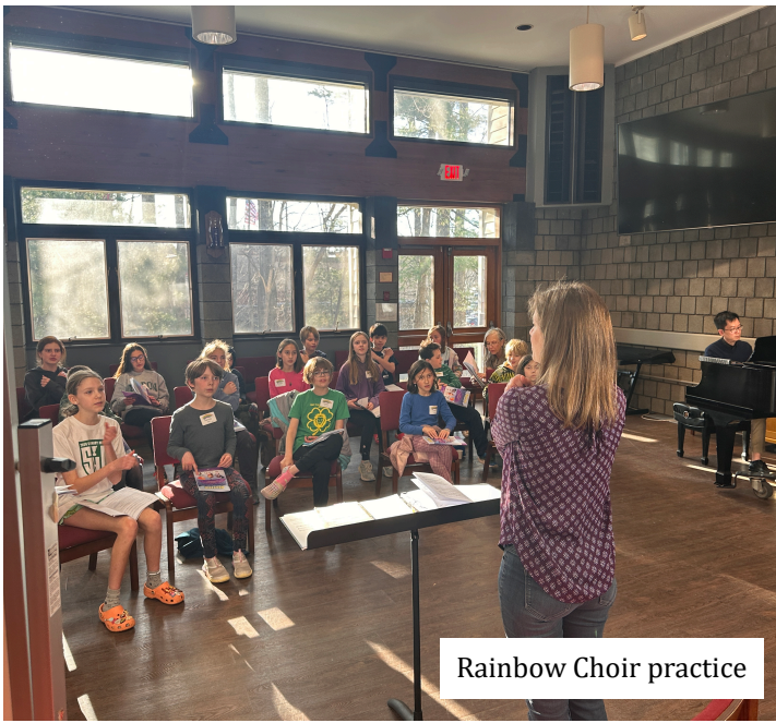
Rainbow Choir practice