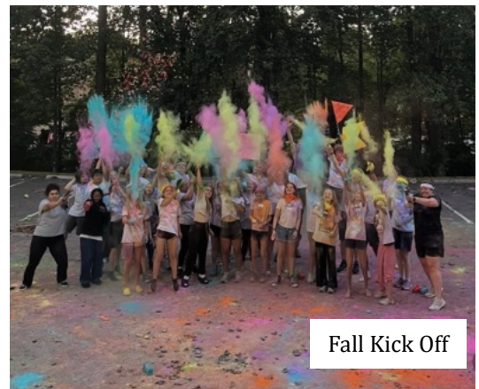
Fall Kick Off