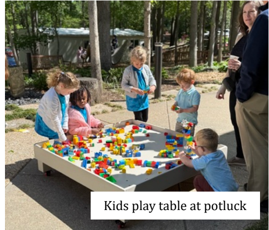
Kids play table at potluck