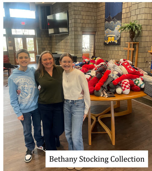
Bethany Stocking Collection