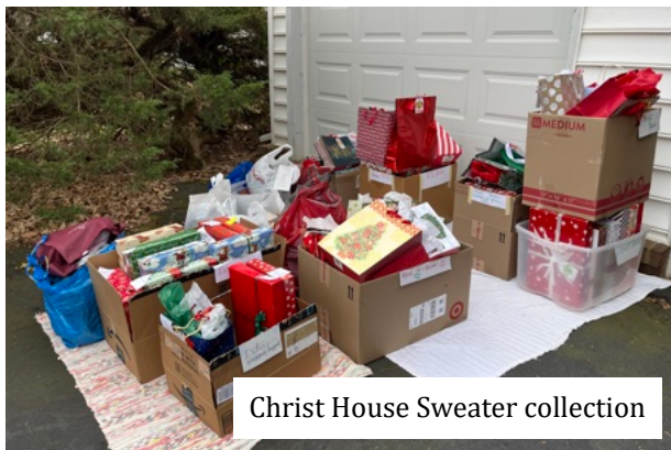
Christ House Sweater collection