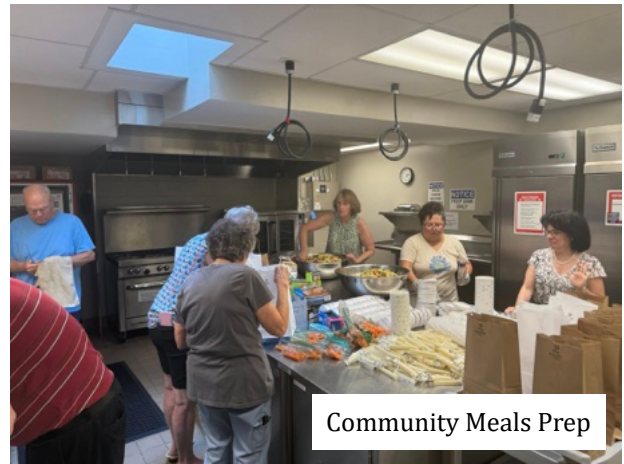
Community Meals Prep