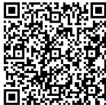
AMAZON WISH LIST LINK

We are also collecting money for solar lanterns for our students and these will be purchased in Nairobi. Please consider a gift toward that by donating $30 to the link below.